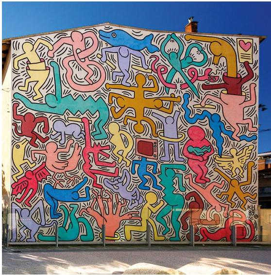
«Tuttomondo» by K. Haring is located in Piazza Vittorio Emanuele, 18 in Pisa

Starting from «Tuttomondo» by Keith Haring (1989), walk the Street Art itinerary promoted by the StART Attitude association since 2017, with 25 wall paintings around the city. In this article (ITA) you will find some pictures and their locations, between the city centre, the Darsena area and the Porta a Mare neighbourhood.